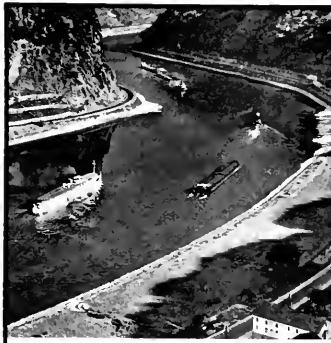
The famous Lorelei Rock overlooks the Rhine

This publication was PC's first venture into assembling a printed alumni directory, and it met with an enthusiastic response. One-fourth of the alumni bought the volume which includes biographical data and listings by class, alphabetical and geographical.